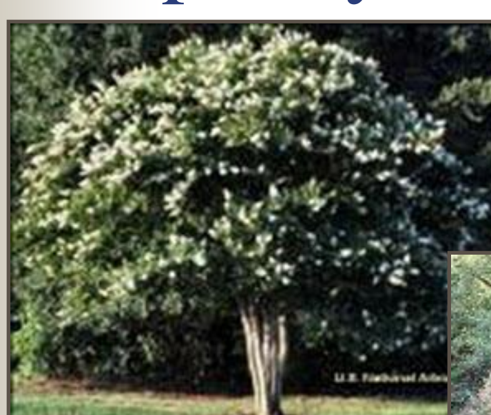
Natchez - Broad tall, 20 – 30 ft.